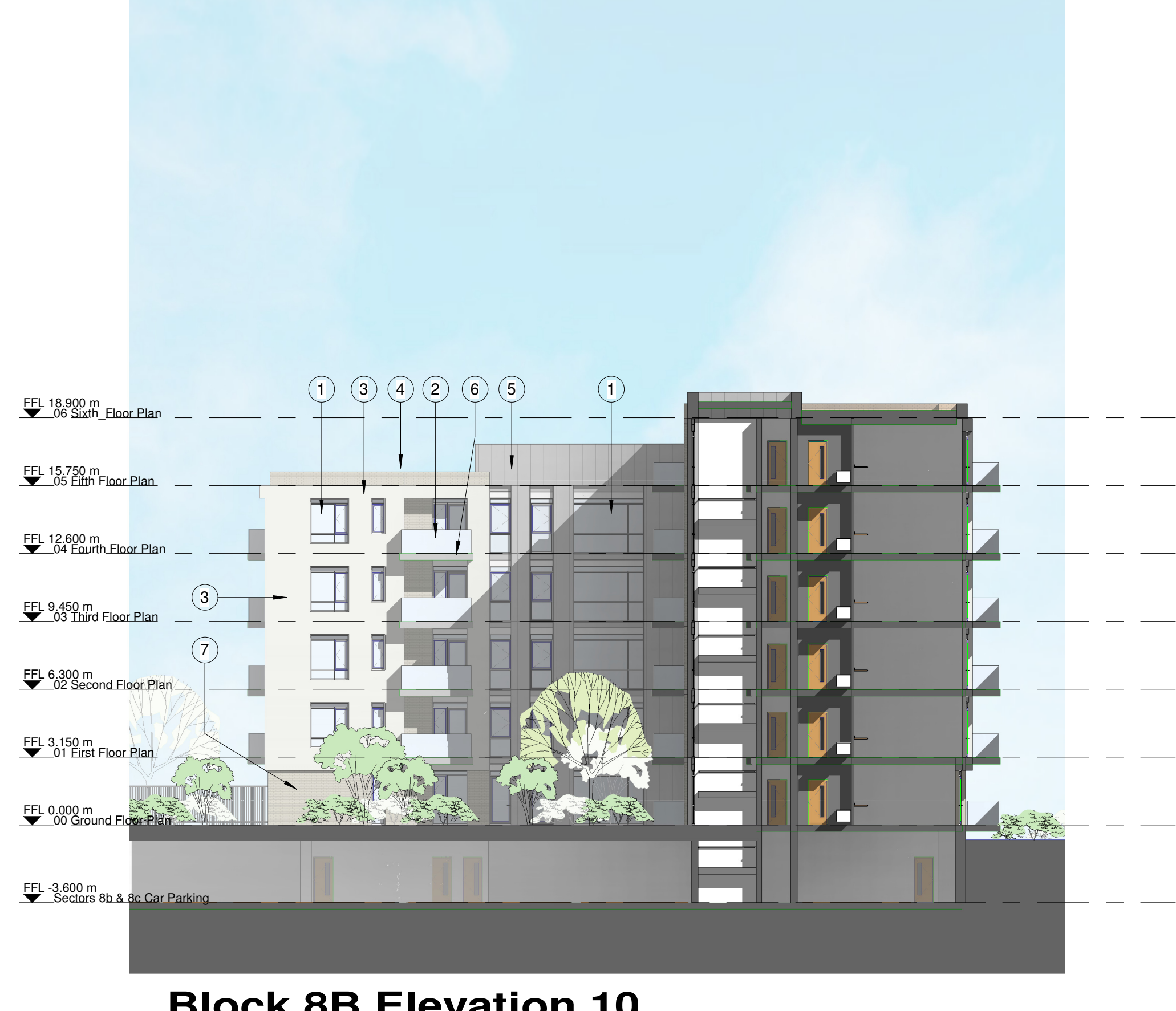
Block 8B Elevation 10